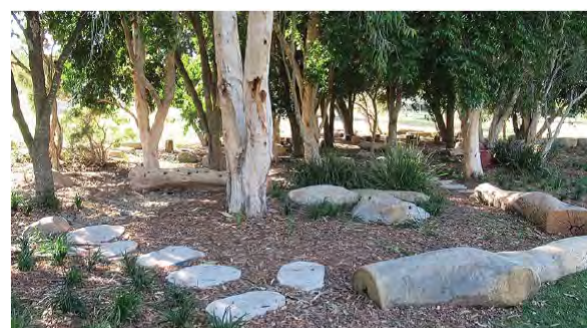
6. Nature play areas