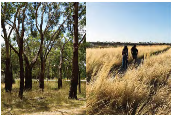
1. Meandering paths through woodland and native grass.