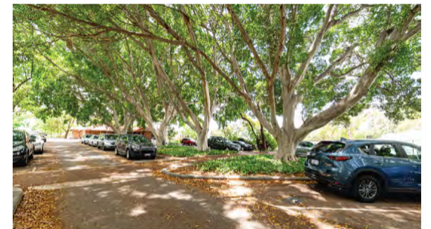
7. Carpark with trees