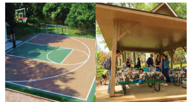
8. Picnic shelter, tables and seats.