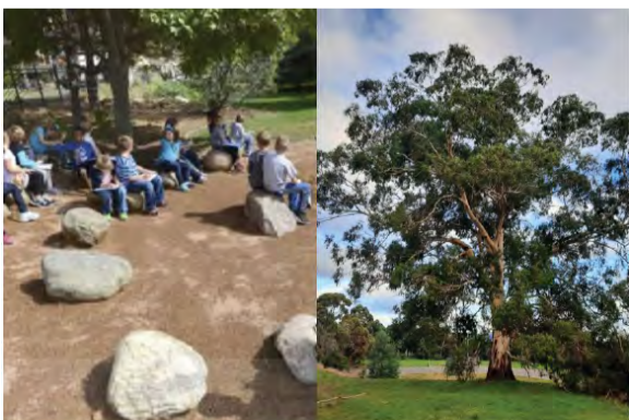
2. Manna gum, feature tree Gathering/educational space around the Manna gum