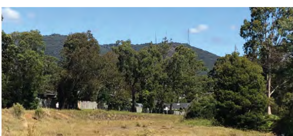
3. Maintain view to Dandenong Mts.