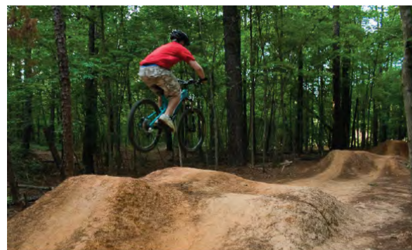
5. Bike jump tracks