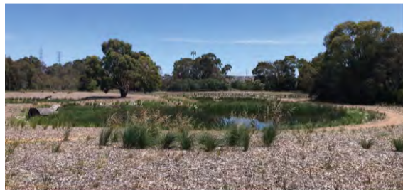
4. Ephemeral water feature / Dry pond